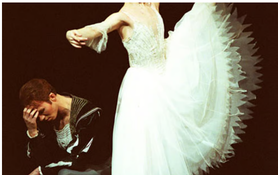
SIGNATURE ROLE: ALINA COJOCARU WITH BOYFRIEND JOHAN KOBORG IN THE ROYAL BALLET'S GISELLE IN 2001