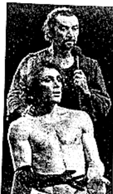
Béjart with Donn in 1975

ON Thursday December 3 in Lausanne, three months ago, Maurice Béjart attended the funeral of his former lover and leading dancer, Jorge Donn, in the morning, and premiered two ballets in the evening. It was a day that set a seal on an annus horribilis — the painful burial of the past and the birth of a new Béjart, cast in quite a different mould from the big bold showman-choreographer whom the world has known for 35 years.